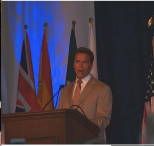
California Gov. Arnold Schwarzenegger