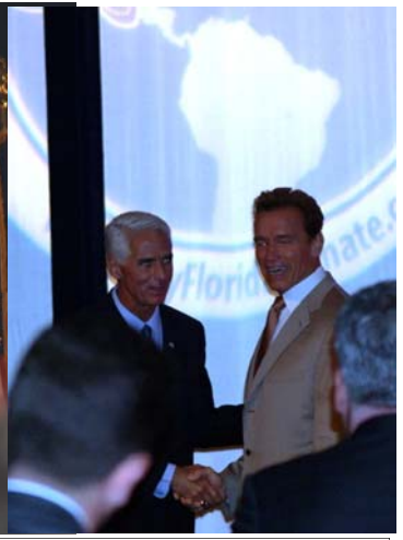
Gov. Charlie Crist and Gov. Arnold Schwarzenegger